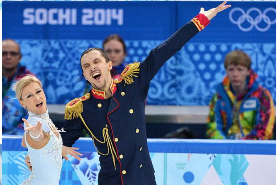
Tatyana Volosozhar & Maxim Trankov in Figure Skating