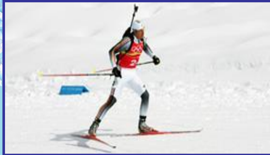
Biathlon Figure Skating