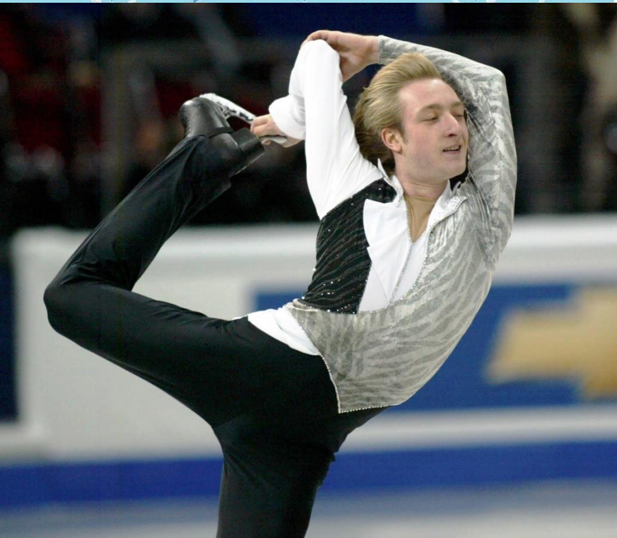
Evgeniy Plushchenko Torino 2006