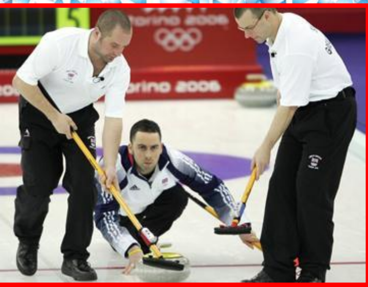
Curling Ice Hockey