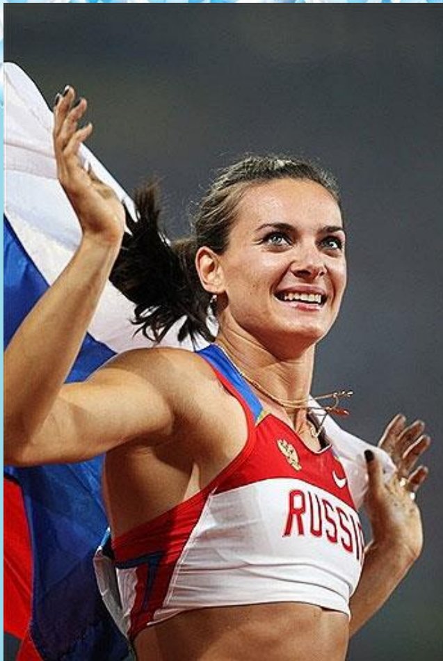
Elena Isinbaeva Athens 2004; Beijing 2008