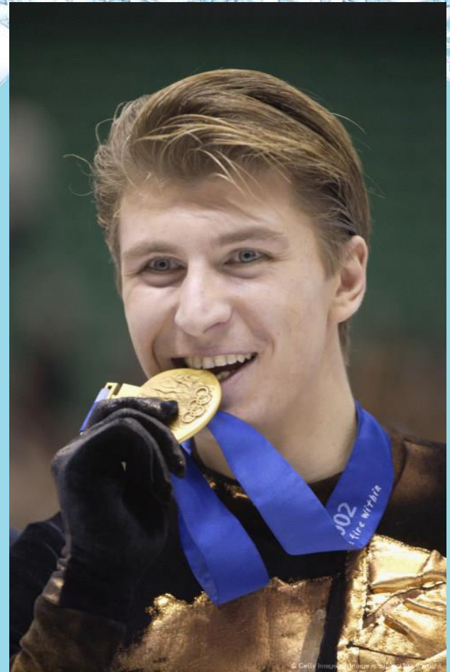
Aleksey Yagudin Salt-Lake-City 2002