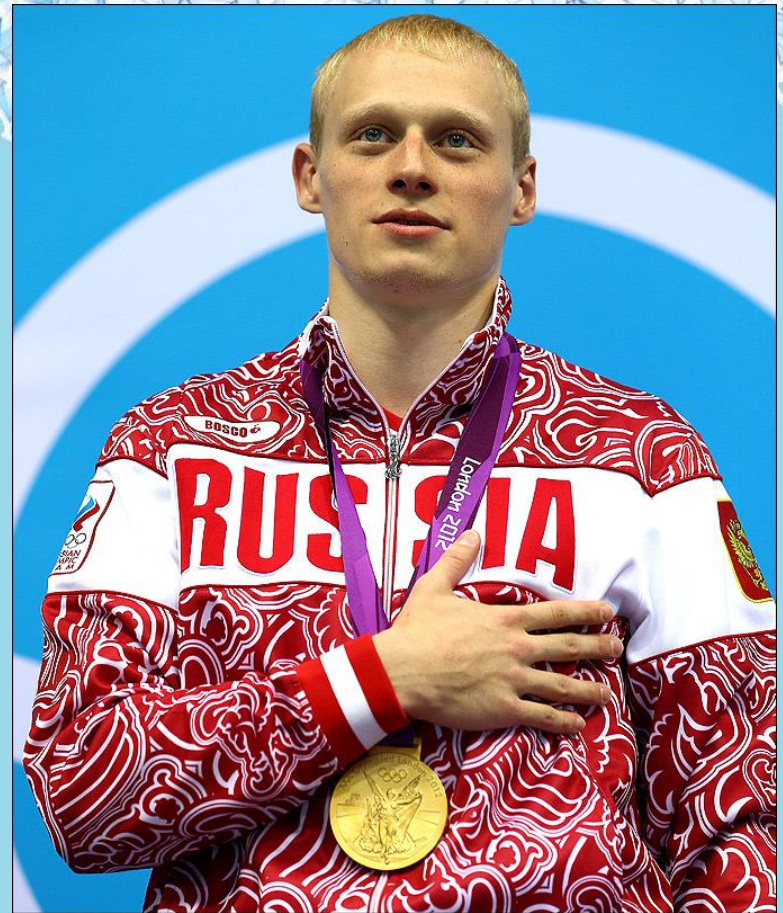
Iliya Zakharov London 2012