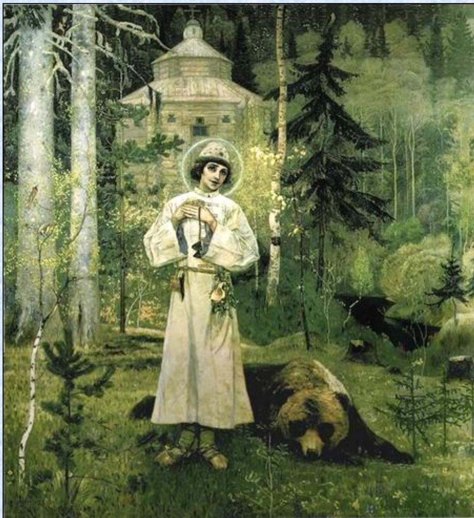
“Юность Преподобного Сергия” Михаил Несторов

After his parents died, Bartholomew gave up his inheritance to his younger brother Peter and together with his elder brother Stephan, settled to live in a wild forest 10 miles away from Radonezh. The brothers cut wood themselves and built a hut and a little church, which they dedicated to the Holy Trinity.