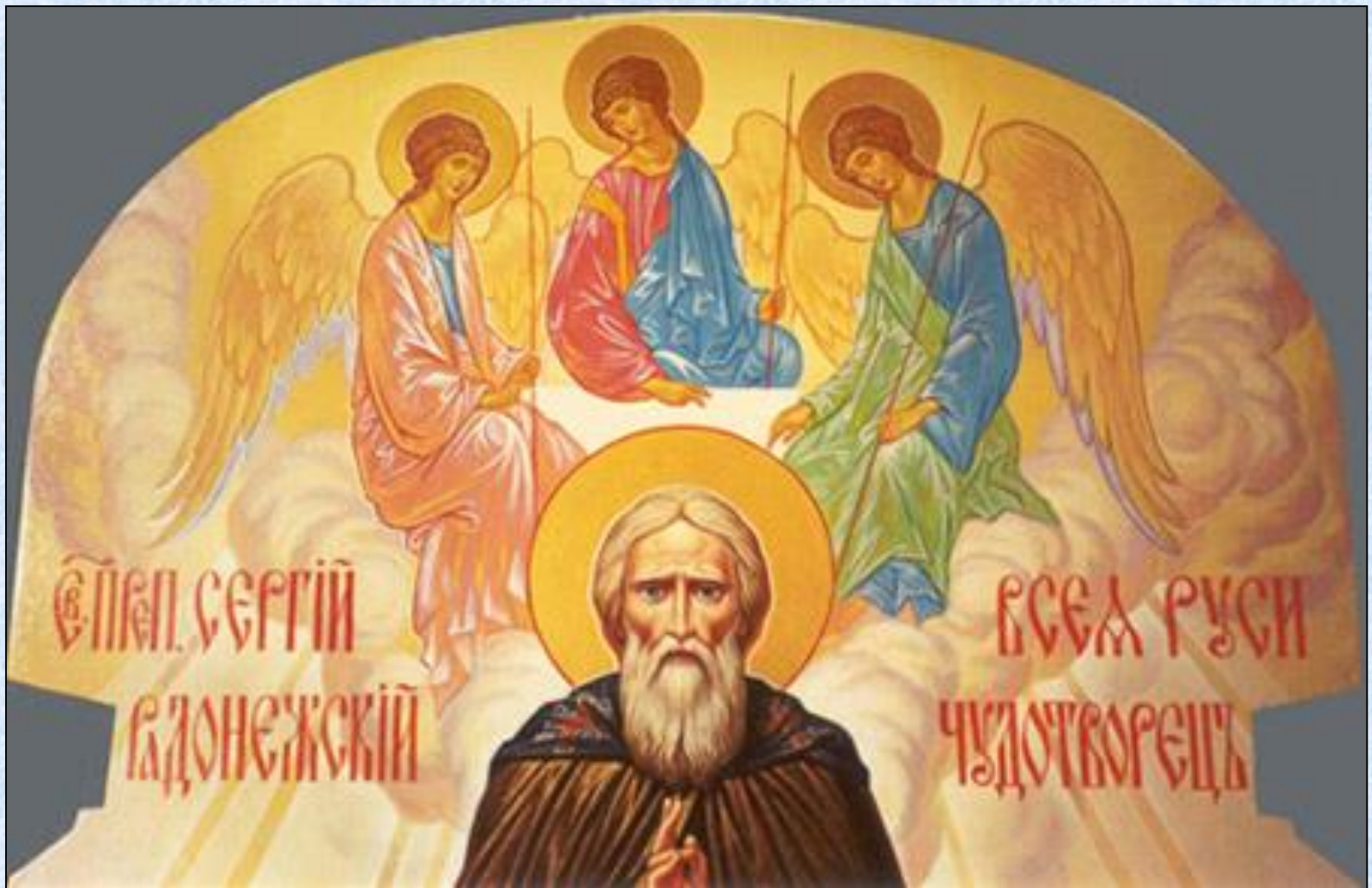
ST SERGIUS OF RADONEZH