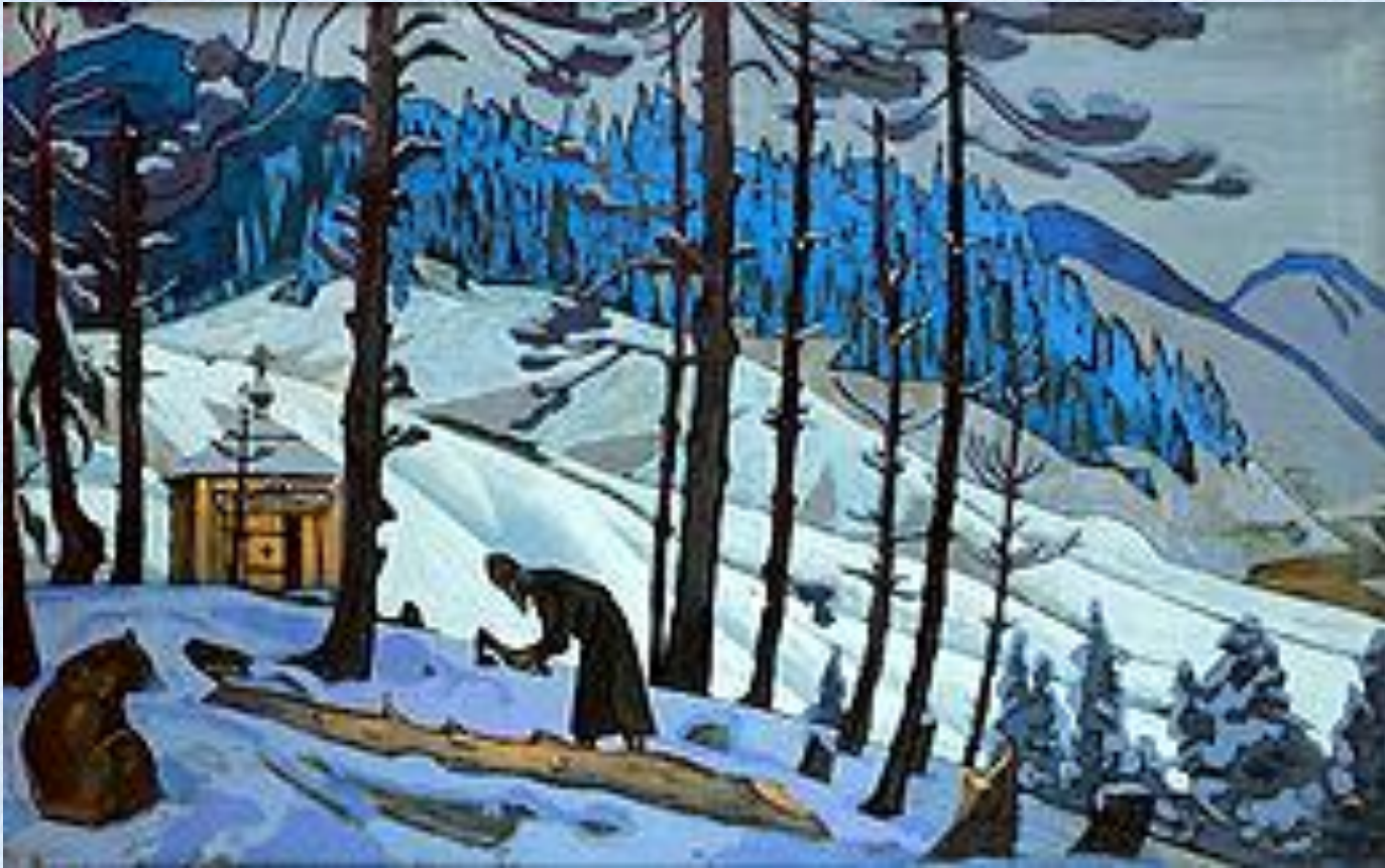
“Сергий Строитель” Николай Перих

Сергий стал основателем Троице-Сергиева монастыря (лавры). Слава Сергия дошла даже до Царьграда.